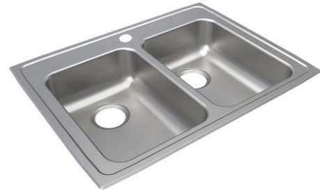
Shown with one-hole configuration. Other configurations available.

Quality Grade Plumbing Products. Since 1933 we have become the industry standard for designing and producing quality grade plumbing products and fixtures. Our role as an industry leader remains unsurpassed.