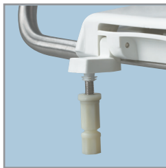
STA-TITE® COMMERCIAL FASTENING SYSTEM™