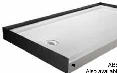
ABS tile flange installed on 3 sides of shower base. Also available on 1 or 2 sides, depending on installation application.

Rigid ABS tile flange is chemically bonded to the shower base at the factory. This not only facilitates installation but also enables a watertight seal on any sides specified.